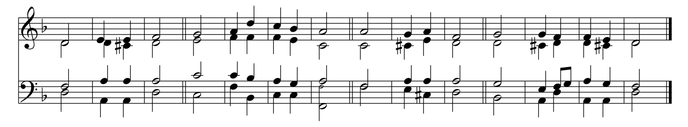
as it was in the be- / ginning, is / now, and / will be for- / ever. \parallel A- / men.