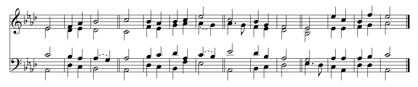
as it was in the be- / ginning, is / now, and / will be for- / ever. \parallel A- / men.